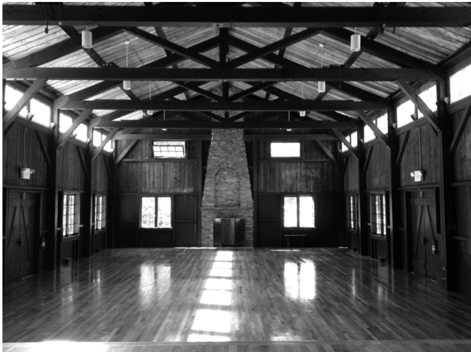
View from stage of main room